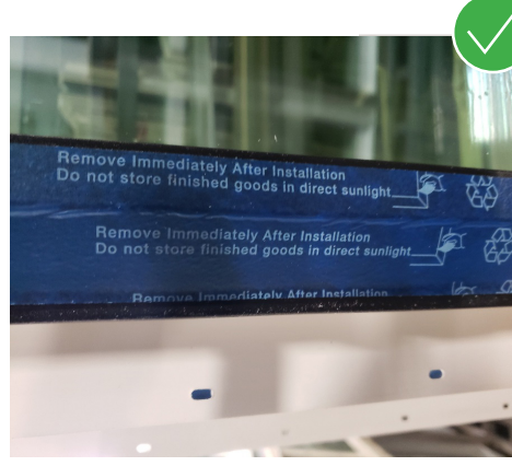
Follow instructions on product labels.