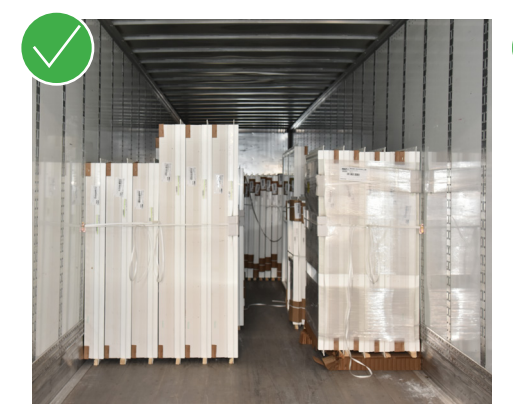
Store products in a safe area protected from the elements. Products should be stored in a direct upright position.