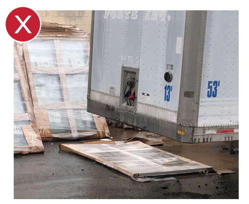
Do NOT lay products flat. Keep products out of traffic areas.