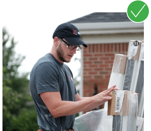
Promptly and thoroughly inspect products when they arrive.