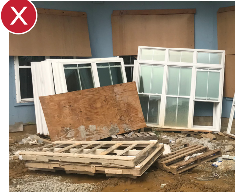
Do NOT stack other construction materials against products.