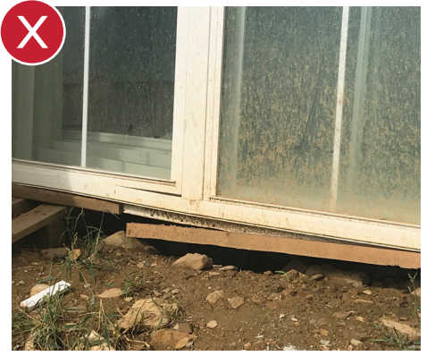
Do NOT sit window on uneven surfaces or without supporting the entire still.