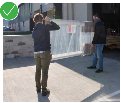
Transport products perpendicular to the ground. Use team lifts for large units.