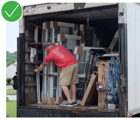
Allow for ventilation when storing products in a trailer.