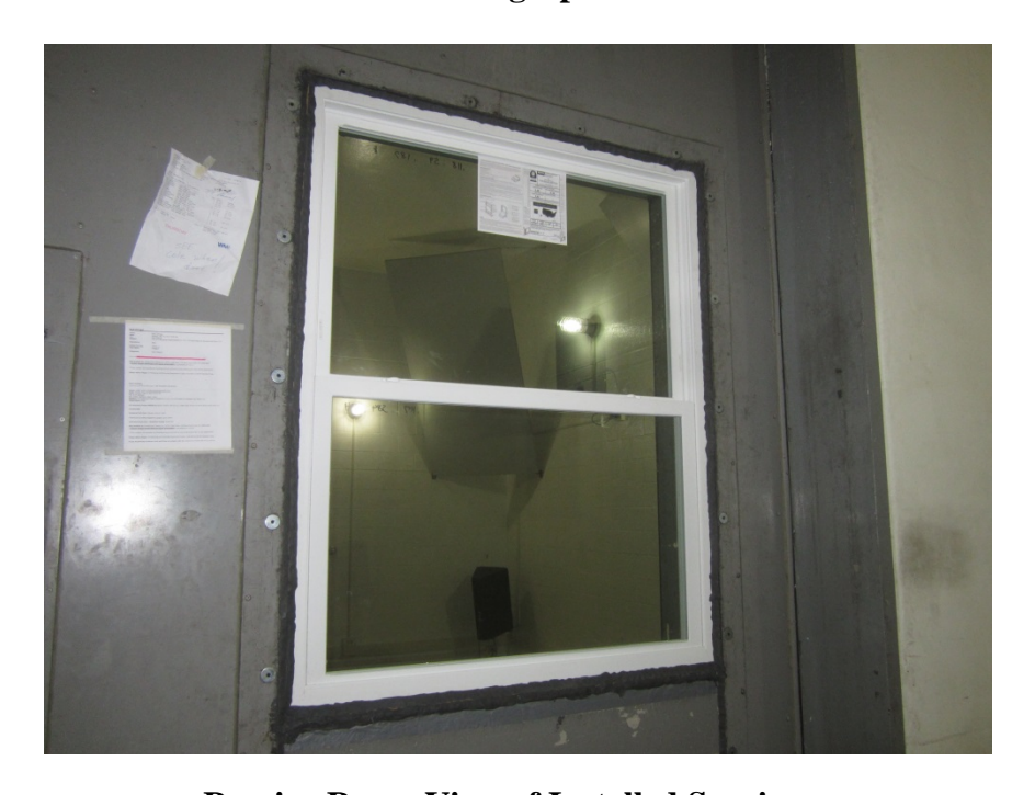
Receive Room View of Installed Specimen