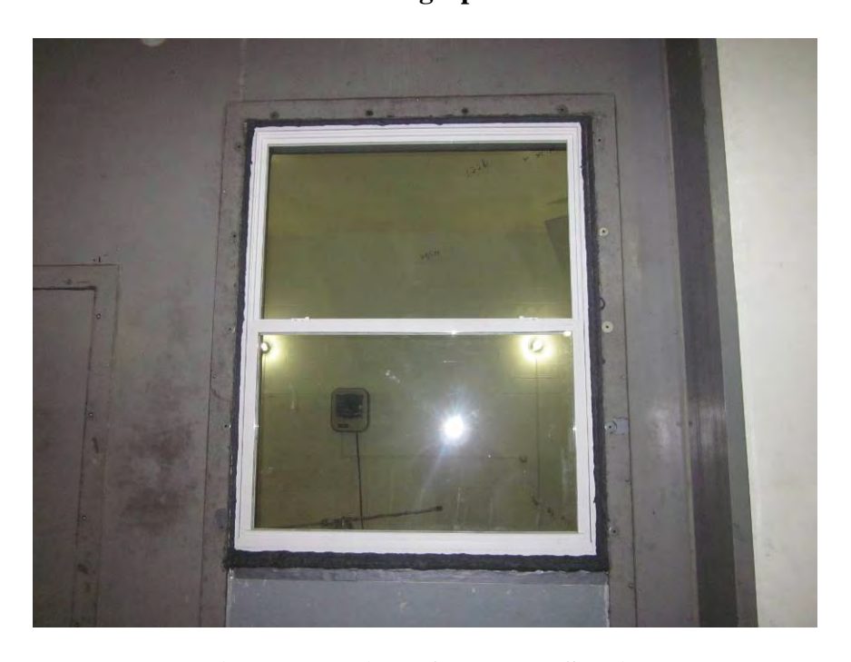
Receive Room View of Installed Specimen