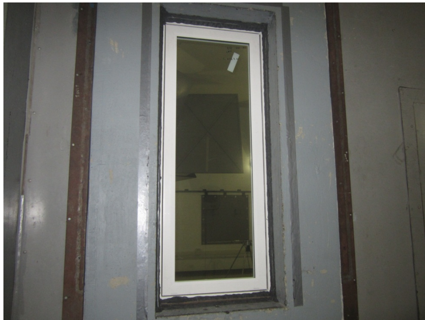
Source Room View of Installed Specimen