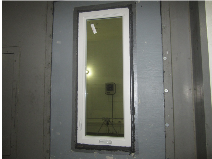
Receive Room View of Installed Specimen