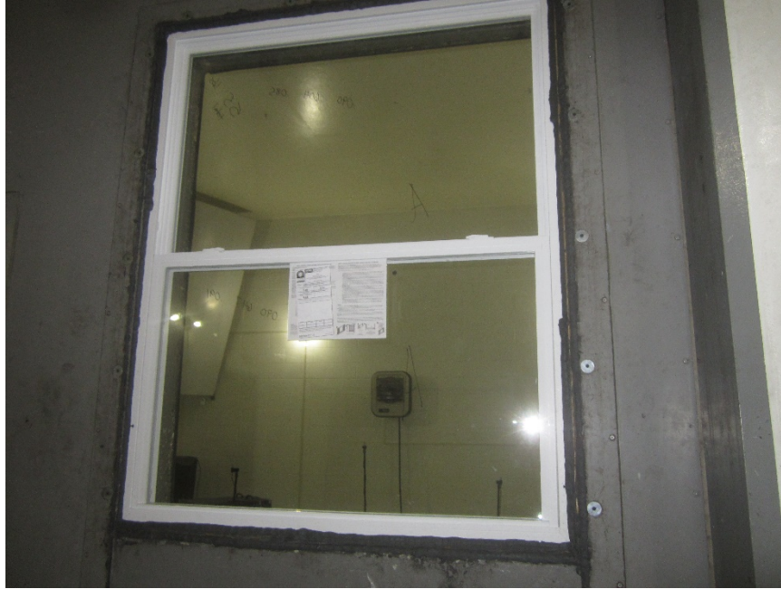
Receive Room View of Installed Test Specimen